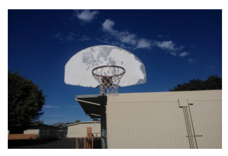
Basketball backboards that need to be painted

I want to share with you how you can be a part of the Great Day of Service. First let me tell you there is a place for you no matter your skills or age. There